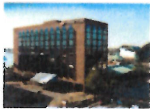
Crown Plaza Hotel 700 Settlers Landing Road, Hampton 757-727-9700 16 miles from the Center