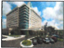
Embassy Suites Hotel at Hampton Roads Convention Center 1700 Coliseum Dr, Hampton 757-827-8200 14 miles from the Center