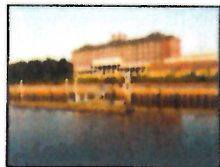
Suffolk Hilton Garden Inn 100 East Constance Rd, Suffolk 757-925-1300 19 miles from the Center