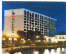
Newport News Marriott at City Center 740 Town Center Drive, Newport News 757-873-9299 17 miles from the Center