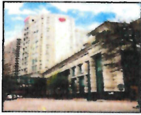
Norfolk Marriott Waterside 235 E. Main St, Norfolk 757-627-4200 12 miles from the Center